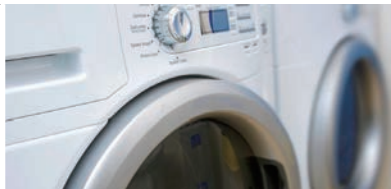
Quality Assurance Test