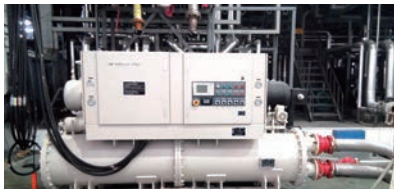
Burn-In, Aging Test