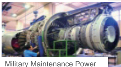
Military Maintenance Power